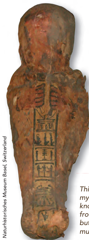
Naturhistorisches Museum Basel, Switzerland