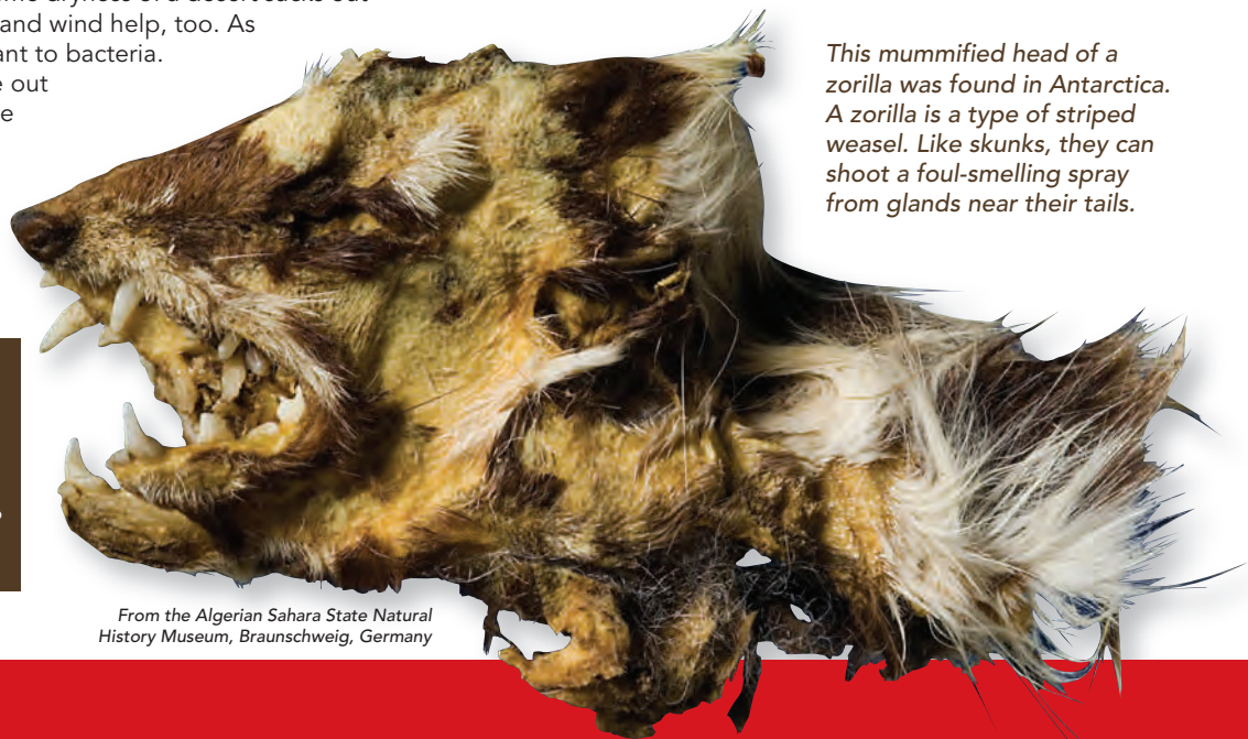
This mummified head of a zorilla was found in Antarctica. A zorilla is a type of striped weasel. Like skunks, they can shoot a foul-smelling spray from glands near their tails.

Scientists who study mummies have to pay close attention to details. What can you tell from the features of this mummy? What do the teeth tell you? What does the fur tell you? What do other details tell you?