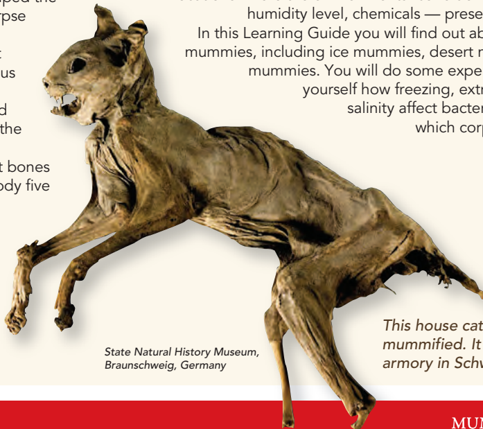
State Natural History Museum, Braunschweig, Germany

In this Learning Guide you will find out about some natural mummies, including ice mummies, desert mummies and salt mummies. You will do some experiments to see for yourself how freezing, extreme dryness and salinity affect bacteria and the rate at which corpses decompose.