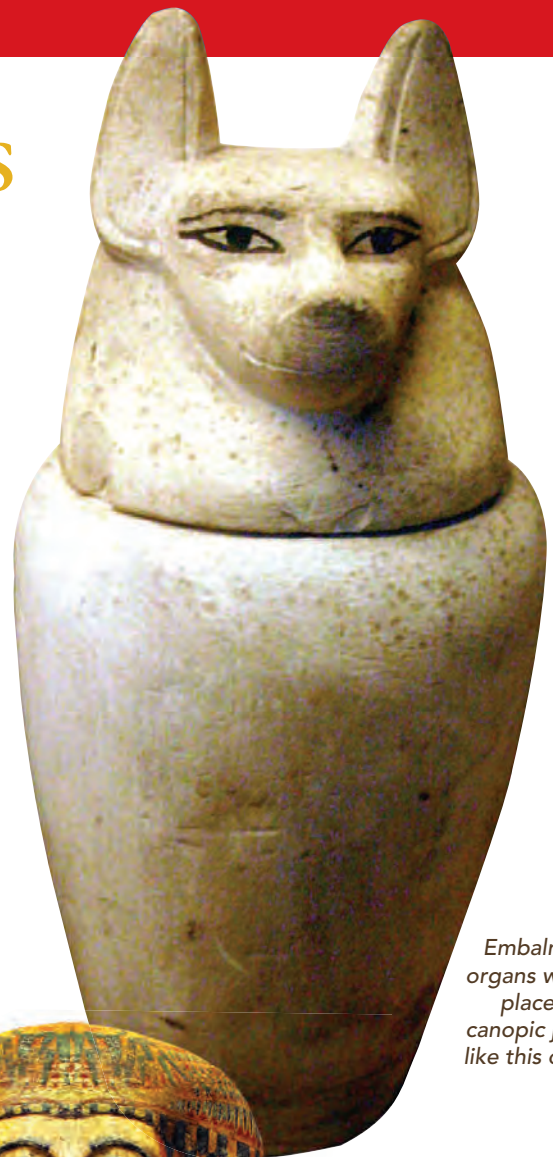
Embalmed organs were placed in canopic jars, like this one.