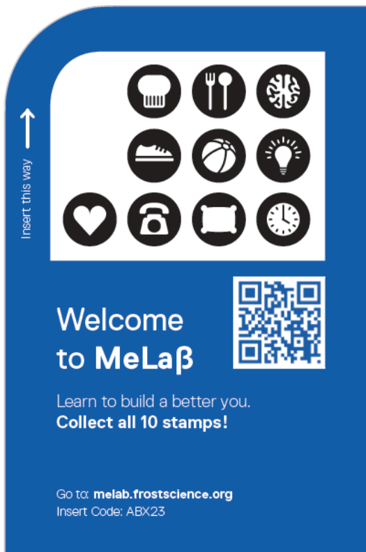
Front of MeLaβ card.